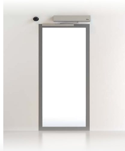
SWING DOOR DAB AND SPRINT