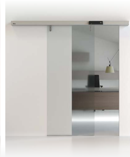
SLIDING DOOR CIVIK AND DAS