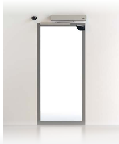
SWING DOOR DAB AND SPRINT