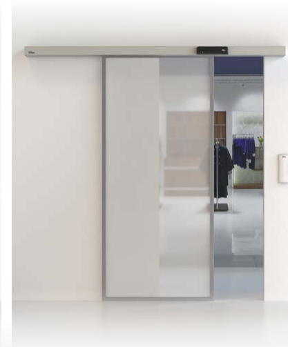
SLIDING DOOR CIVIK AND DAS